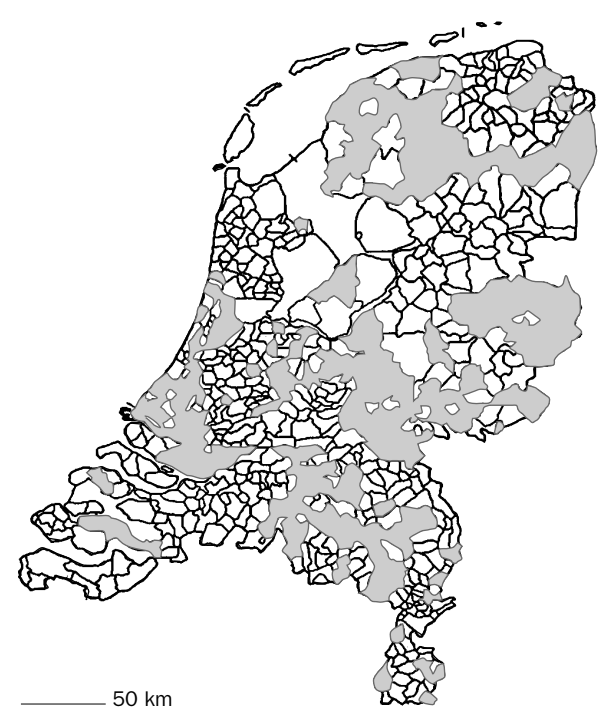
\label{eq:Figure 1: Distribution of the municipalities of the NLCS study population over the Netherlands

Motorised traffic emissions result in small-scale spatial variations (high concentrations at short distances from major roads) and affect urban and regional background air pollution concentrations. We quantified small-scale spatial variations in air pollution concentrations by calculating proximity to major roads. For urban and regional background concentration, we used concentration data for the pollutants black smoke and nitrogen dioxide, both of which are indicators of traffic-related air pollution. Exposure to traffic-related air pollution has been characterised by estimating long-term average ambient air pollution concentrations at the 1986 home address. Details of the exposure assessment procedures have been described previously.14 Briefly, the addresses were geocoded with a geographic information system. Long-term average exposure to outdoor air pollution was calculated as a function of the regional background pollution, pollution from urban sources (urban background), and pollution from local sources (nearby streets).