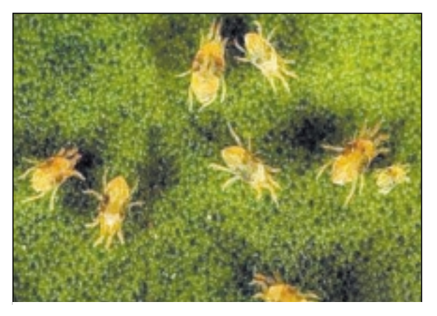
Fig. 1. Two-spotted spider mite, Tetranychus urticae Koch (Fasulo TR, Denmark HA) – brown to orange red in colour and 0.4 mm in length.

Spider mites belong to the family of phytophagous outdoor mites as opposed to the common indoor housedust mite that lives on human debris. Tetranychus urticae is a microscopic mite (commonly known as red spider) which parasitises fruit trees, herbaceous plants and greenhouse crops worldwide (Fig. 1).<sup>10</sup> Spider mites rapidly develop injurious populations in spring, damaging fruit leaves and in some cases causing defoliation.<sup>11</sup> Although predaceous mites attack spider mites, the predator complex does not usually control spider mites, particularly when spray programmes of organophosphates or sulphur upset natural control (Fig. 2).<sup>12</sup>