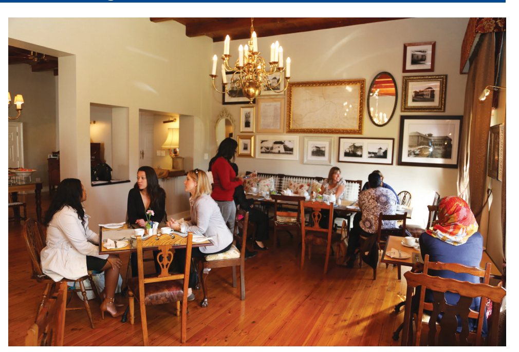
Original materials were used and the look of the building was conserved, with some of the old brickwork visible. Some of the original paintings from the home have been restored and are displayed along the walls.