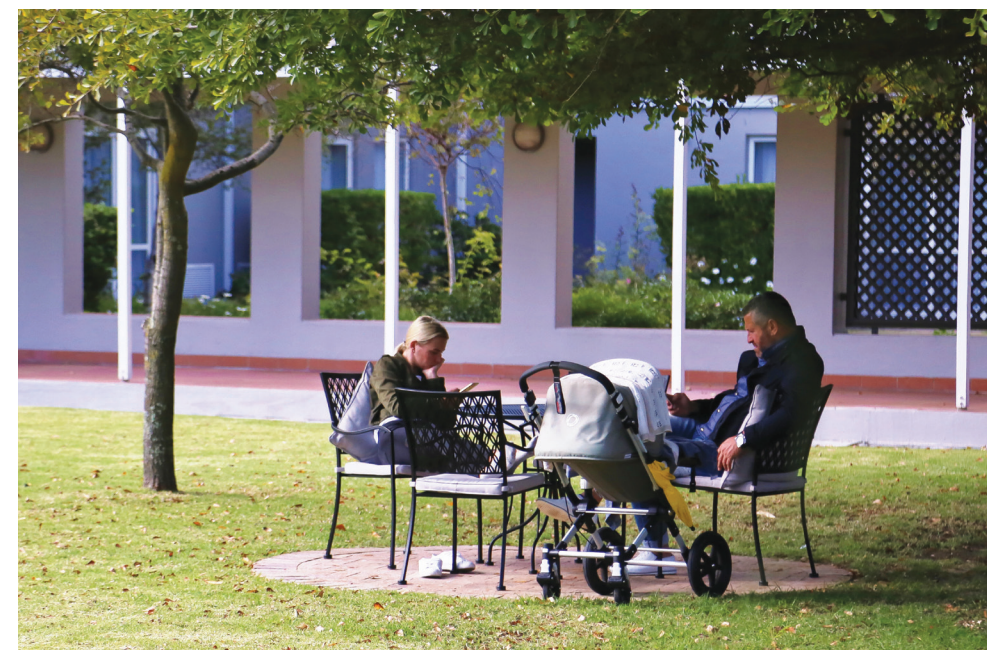
The estate has large grassy areas and is dotted with rose and herb gardens throughout (as well as water features). The hotel is also on the doorstep of the Wild Fig restaurant, The River Club, and close to the banks of the Liesbeek River and the Raapenberg bird sanctuary (with its Cape dwarf chameleons, pelicans and flamingos).