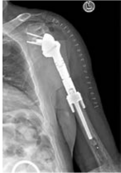
Figure 5: Post-operative X-ray showing wide resection of the tumour. The skeletal defect has been reconstructed with a modular reverse total shoulder tumour prosthesis.

different. It shows the extent of the tumour up and down the arm. This is a fluid sensitive sequence and helps to show inflammation and oedema caused by the tumour.