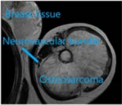
Figure 3: An MRI showing an axial image of the above patient's mass. It shows a large soft tissue mass originating from the left humerus. The neurovascular bundle is displaced medially as are the surrounding muscles of the upper arm. Hopefully neoadjuvant chemotherapy will help to reduce the size of the lesion and allow limb salvage.