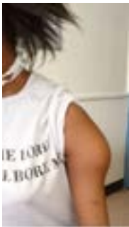
Figure 1: Clinical photograph depicting the swelling on the lateral aspect of the upper arm. There are no changes in the overlying skin.

A 12-year-old female patient presents with a swelling on the left upper arm. The mass was first noted about 2 weeks ago and is painful at rest. She has had no previous trauma to the shoulder region and has no other medical problems. The mother states that she has had a couple of episodes of low-grade fever over the past 2 weeks, without any other symptoms. Examination reveals a large, firm, non-tender mass located deep to the fascia. There is no neurovascular deficit.