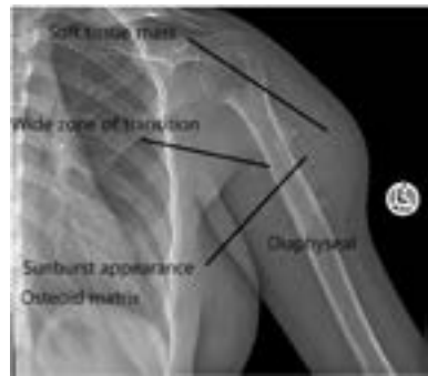
Figure 2: Anterior-Posterior (AP) X-ray of the patient's left upper arm and shoulder showing a diffuse lytic lesion in its shaft/diaphysis extending in a centrifugal (in all directions) manner. Working from the outside in; there is extensive soft tissue extension from the bone, the matrix of the lesion shows cloud-like / ill-defined amorphous ossification in parts. There is a wide zone of transition between the normal bone and diseased bone meaning that the border between them is not easily defined. The lesion is lytic in nature giving the humerus a moth-eaten appearance. These are all features of a malignant bone sarcoma.