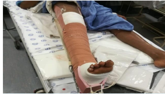
Image of a common scenario in the emergency unit. The Thomas Splint is adequately sized, both in length and width. Access to assess the neurovascular function of the foot is provided. The next step is a radiographic assessment, continuous fluid monitoring, analgesia and referral to orthopaedic surgery for definitive management.