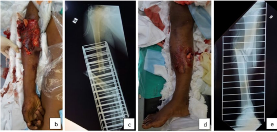
Clinical and radiological images of open fractures

Irrigate, stabilise and administer appropriate early antibiotics. See the chapter on 'Orthopaedic Injuries'.