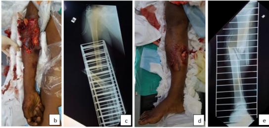
Clinical and radiological images of open fractures

Irrigate, stabilise and administer appropriate early antibiotics. See the chapter on 'Orthopaedic Injuries'.