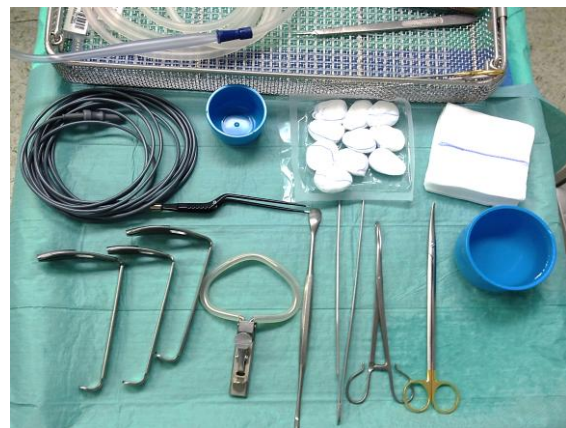
Figure 2: Instruments to perform radiofrequency dissected tonsillotomy / partial tonsillectomy

The quickest and easiest way to perform tonsillotomy is with monopolar high frequency dissection ( Video 3 ). Instrumentation is shown in Figure 2 .