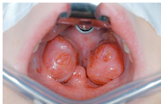
Figure 1: Hyperplastic tonsils in a child

The lymphoid tissue is separated by a capsule from the surrounding muscle (superior pharyngeal constrictor) 8 . The blood supply originates from four different vessels, the lingual artery , the ascending pharyngeal artery and the ascending and descending palatine arteries . These vessels radiate mainly to the upper and lower tonsillar poles, as well as to the centre of the tonsil from laterally 9 . The tonsils have deep crypts that create a large surface area to provide a docking surface for potential antigens 10 .